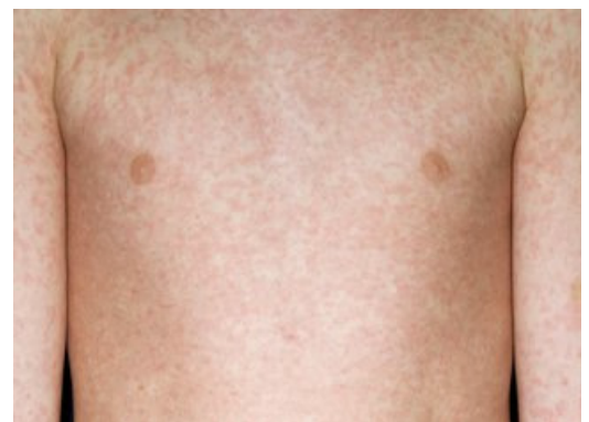
The measles rash appears around 2 to 4 days after the initial symptoms and normally fades after about a week.