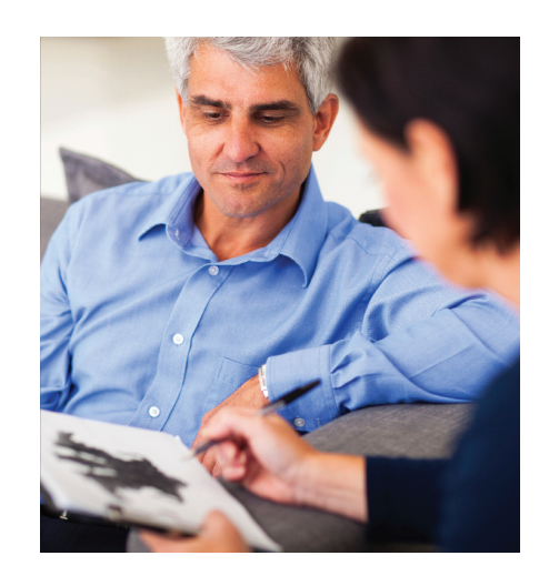
who we are

SAGE is a home counselling service for adults of all ages who have difficulty getting out, and who may be faced with: